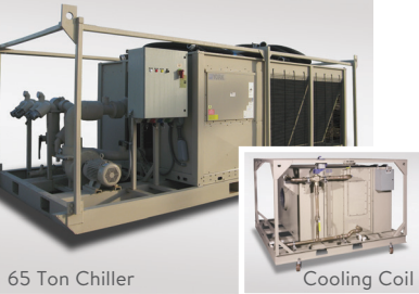
65 Ton Chiller