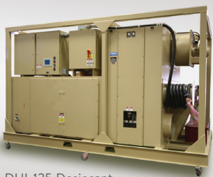
DHI-125 Desiccant Dehumidifier