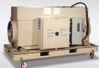
HO-150 Electric Heater