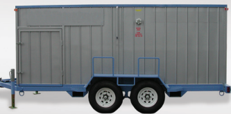
HDS-12 Indirect-Fired Heater