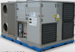
HCU-6000 Desiccant Dehumidifier